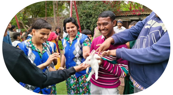
VISIT TO MOGLY'S FARM ON FEBRUARY 28 TH 2025