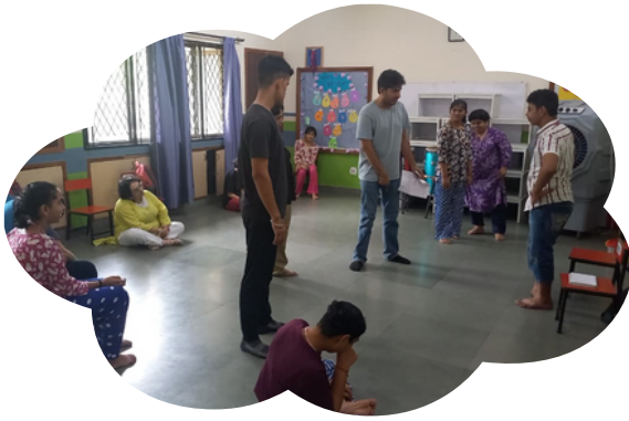
Theatre Class in Action