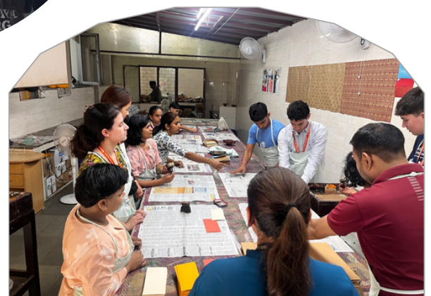
VSAI volunteers and staff spreading the joy of creating art with blocks at Sanskriti School in a workshop on Block Printing.