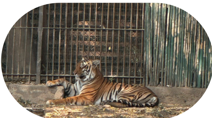
DELHI ZOO VISIT ON MARCH 25 TH 2025