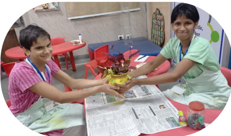
AIRFORCE GOLDEN JUBILEE SCHOOL, SUBROTO PARK