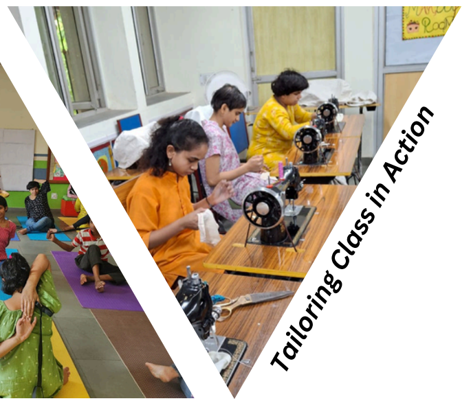
Tailoring Class in Action