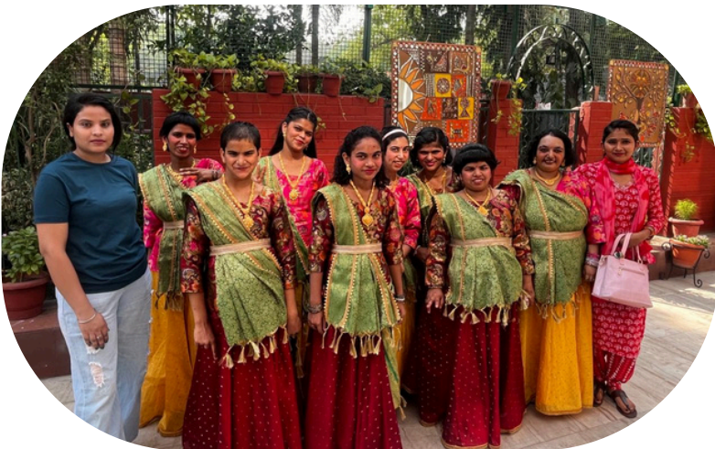
SPRINGDALES SCHOOL, PUSA ROAD

By providing opportunities for special students to participate in inclusive events, VSAI fosters a supportive environment that encourages growth, empowerment, and inclusivity. This initiative reflects VSAI's commitment to promoting the holistic development of students with special needs.