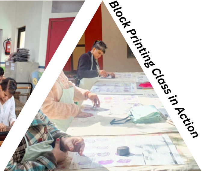
Block Printing Class in Action