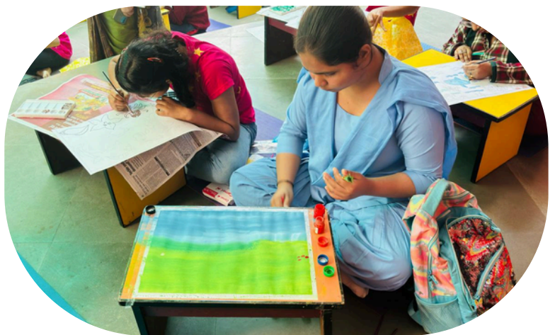
On The spot Painting Competition, March 12 th 2025