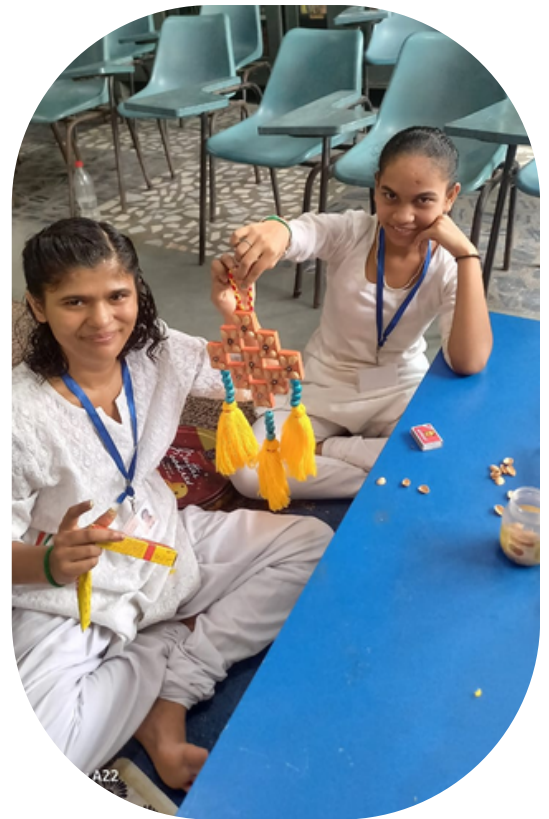
AKSHAY PRATISHTHAN, VASANT KUNJ