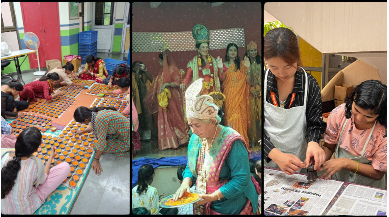
VOLUNTEERS IN ACTION AT VSAI

At VSAI, we firmly believe that community is the heartbeat of our organization. We're passionate about fostering connections and building relationships that bring people together. We've had the absolute pleasure of hosting several groups of enthusiastic volunteers & students from various institutions regularly, who spent memorable days with our remedial and special students.