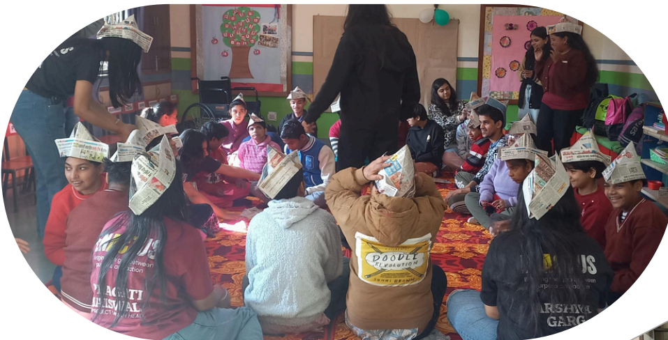
ENACTUS- MATREYI COLLEGE

We're always looking for opportunities to collaborate with like-minded individuals and organizations. If you're passionate about making a positive impact in the lives of others, we invite you to join us in our mission. Together, we can create a brighter future for our students and spread kindness throughout our community.