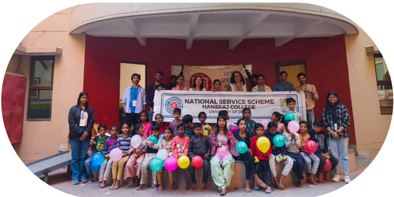
HANSRAJ COLLEGE- VALENTINE'S WEEK COMMUNITY SERVICE