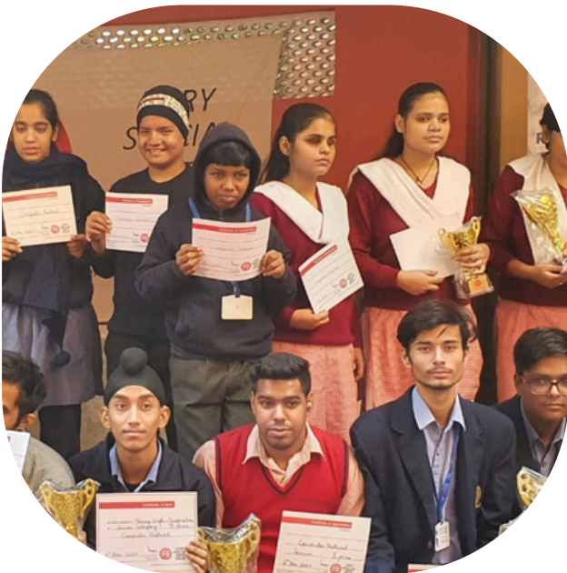
Computer Festival, December 6 th 2024

These festivals not only celebrate the students' talents but also contribute to their overall development, helping them become more confident and active members of society.