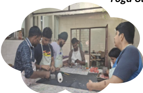
Candle Making Class in Action