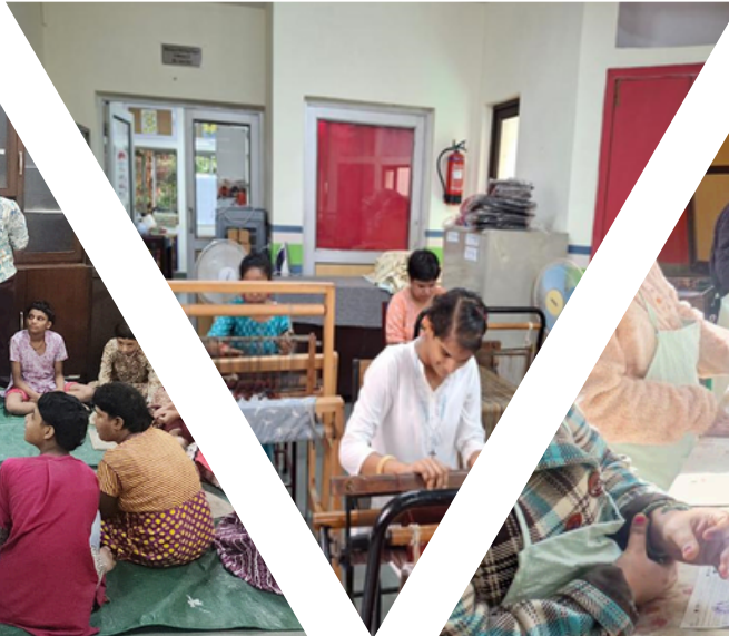
Weaving Class in Action