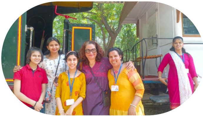
RAIL MUSEUM VISIT ON MAY 3 RD 2024

VSAI's commitment to holistic education is reflected in initiatives like these, which prioritize student welfare and development. These excursions demonstrated the power of experiential learning in empowering students with special needs, promoting their integration into society, and unlocking their full potential.