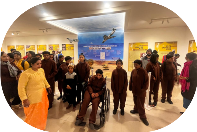
VISIT TO AIR FORCE MUSEUM ON JANUARY 23 RD 2025