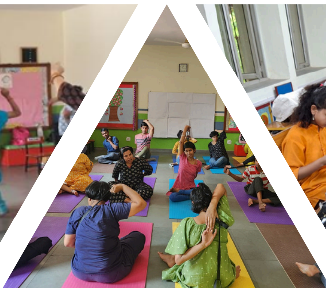
Yoga Class in Action