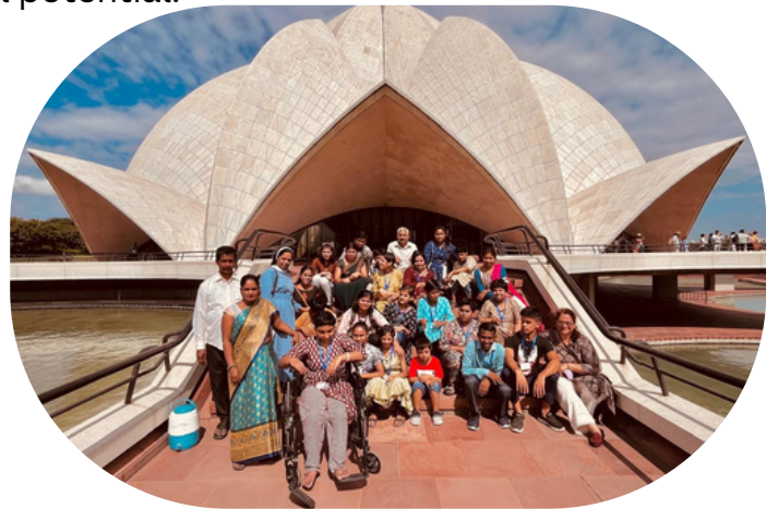
LOTUS TEMPLE VISIT ON SEPTEMBER 27 TH 2024