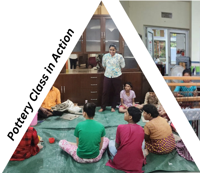
Pottery Class in Action